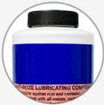
Brush Top Bottles