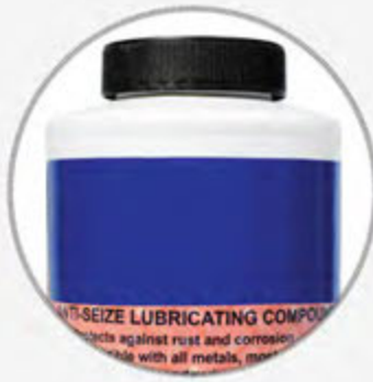
Brush Top Bottles