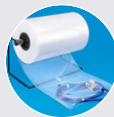
Medical cleanroom use packaging