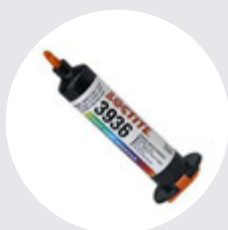
Medical adhesives, tapes & films

Through supplier-partnerships with key industry manufacturers, Hisco is equipped to offer medical manufacturing solutions to address any assembly challenge.